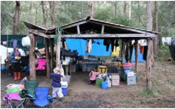
Humffray River Shelter

In the morning as we packed up, two motorbike riders arrived at the unattended campsite. When asked if they got lost yesterday they answered with a reserved "Yes"