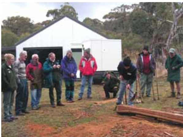
Some adze work on timber post preparation.