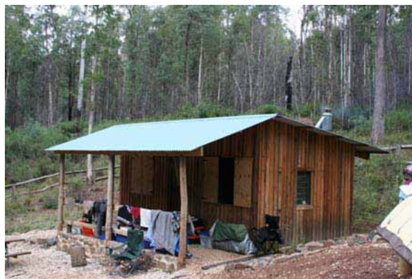
Riley's Creek Hut

Saturday morning we headed off to assess the remains of West Humffray Hut, the rebuilt Riley's Creek Hut, the deteriorating Humffray River shelter as well as Guys Hut on Mt Sarah. We also inspected the site of the Selwyn Hut but missed out on the Shower Block Hut due to it being late in the day. We made camp once again near Abbeyyard close to an unattended campsite. The rain had held off for most of the day however we did get a light sprinkling of snow at Guys Hut.