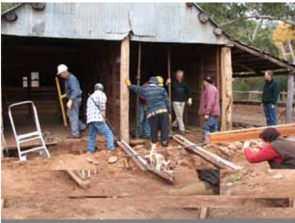
Removing floor & securing roof.