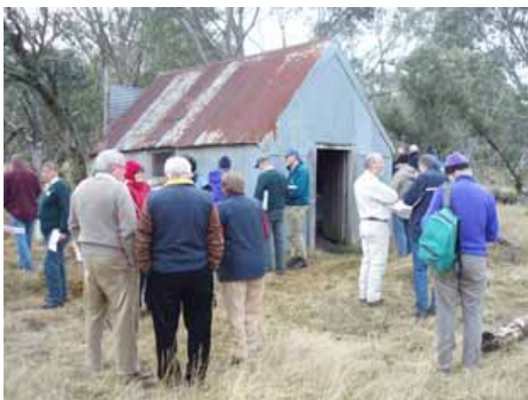
Field Inspection No. 1 - DIY Hut Maintenance Plan - CRB Hut Dinner Plain.