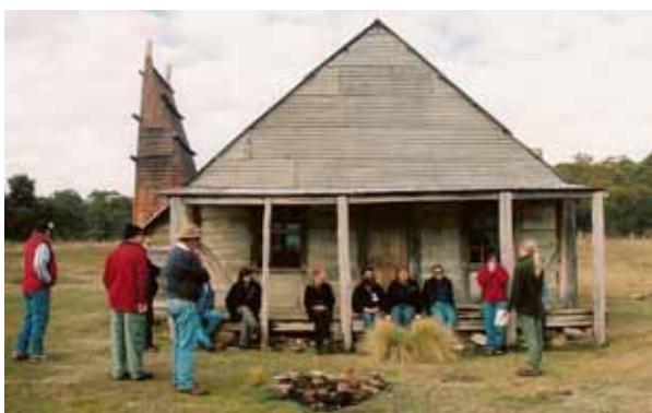
And a nice spot to stop and have a chat.

Whilst the conference was about the skills associated with hut maintenance it also highlighted huts in the landscape – the landscape around a hut that is an integral part of its story and history including prior indigenous activity.