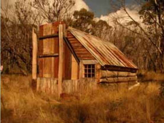
Before the big clean-up, photo by Sue Manneken