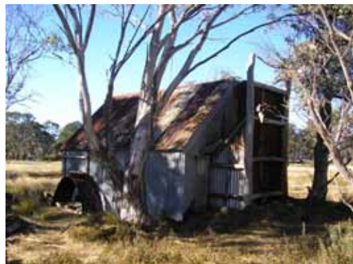
What a difference a couple of weekends and willing workers make