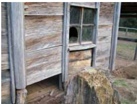
The missing slab and broken window